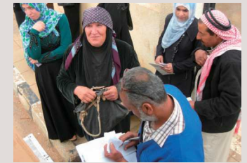
▲ Refugee Camp in Jordan

We assist the Syrian Refugee Camp in Jordan and Myanmar refugees in Thailand to help people to have access to the basic requirements for a dignified life. Our activities include supplying hygiene equipments and shipping of clothes donated by Japanese citizens.