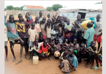
▲ Children in South Sudan

We support the local NGOs in in South Sudan and Myanmar, working on building self-reliance of people and creating a resilient community. We assist activities for children such as construction of Children center and school dormitory. We also assist educational, vocational, cultural and sports programs to improve mental and physical well being.